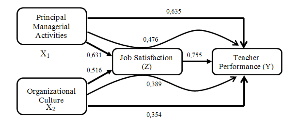
Figure 2. Final Relationship between Variables

managerial skills in terms of concept, human, and good techniques.